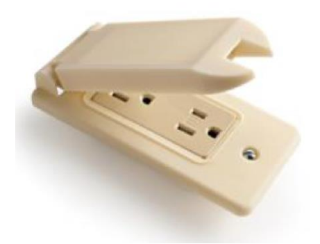
Power Up! USB Outlet Redesign

This year's contest challenges students to design a hinged, covered enclosure (sample pictured below is only meant to show a sample of the hinged cover) for a wall-mounted standard USB port. Teams will need to design a device that fits into the testing rig and performs a specific task. They will also need to use their 3D printing knowledge to design a part that prints within the specified build volume, materials and times specified.